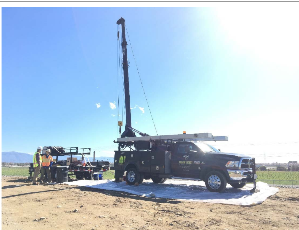
Development phase of SSV2 well (Contractor: Yellow Jacket)